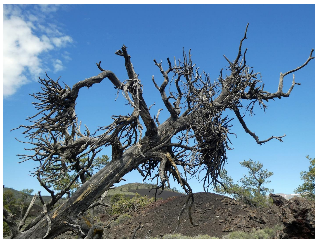
Tree with "witches' brooms". Dwarf Mistletoe settled on this tree. It's a parasite plant that draws nutrients from its host tree, weakening it but not killing it. It also secretes a hormone into the host tree, which causes the tree to grow several more branches where the mistletoe is, bringing more nutrients to the mistletoe. A clump of these branches is what is known as a witches' broom.