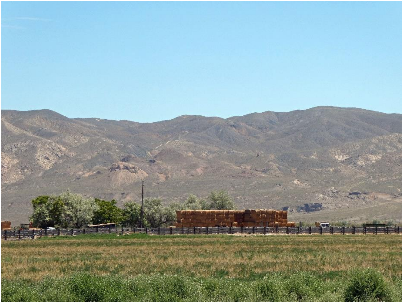
Nevada farm country, irrigated with water from the Humboldt River

The hydrographic Great Basin is an area that covers most of Nevada, large parts of Utah, Oregon and California and small parts of Idaho, Wyoming and Mexico, where there is no natural flow of water to the sea. All precipitation evaporates, soaks into the ground or flows into (generally salty) lakes. The Humboldt River is the longest river with the biggest watershed in Nevada, flowing from east to west across central Nevada until it runs out of lower places to flow and ends at the Humboldt Sink. The Sink sometimes is dry, and sometimes is home to a shallow, evaporating lake, depending on how much water reaches it.