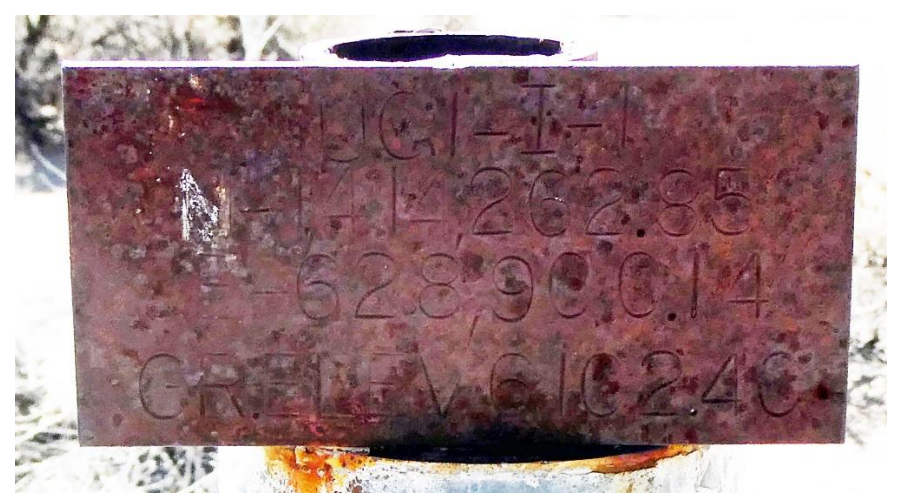
Marker on one of two nearby bore holes used to determine the makeup of the underlying rock (I had to Photoshop the heck out of it to make it at all readable)

The top of the steel tube, sealed with concrete. You can see how much the earth dropped here.