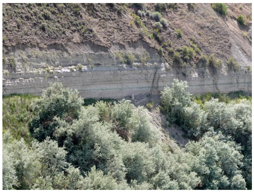
At Hagerman's Snake River Overlook, you can see some of the sediment layers from the ancient ponds from which many fossils have been excavated.

have been disappointed due to the limited display of such fossils – or, as was the case this time, its offsite visitor center was completely closed. The site itself is worth visiting for a couple reasons, but you won't see any fossils there.