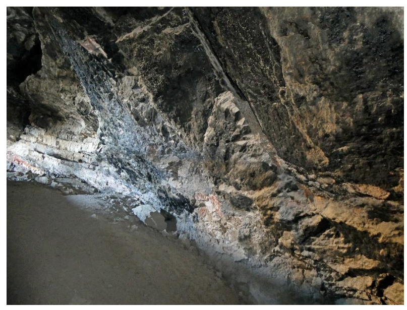
The artifacts already excavated, what you mostly will find in the cave is soot on the ceiling from ancient fires, a common feature of rock shelters. I didn't find any rock art at the site.

A weather system moved into the region that night, bringing with it cold rain and even snow in the higher elevations. I had planned on exploring some Oregon back country sites associated with the Owyhee River and its canyons, but the roads are impassable when wet. I came up with a different route through Oregon.