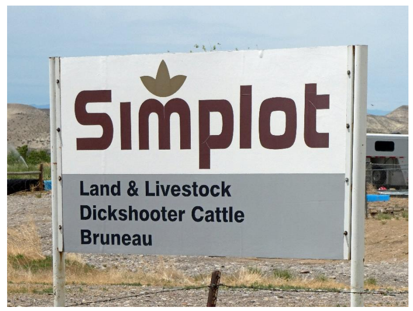
I guess that there's more than one way to turn a bull into a steer.