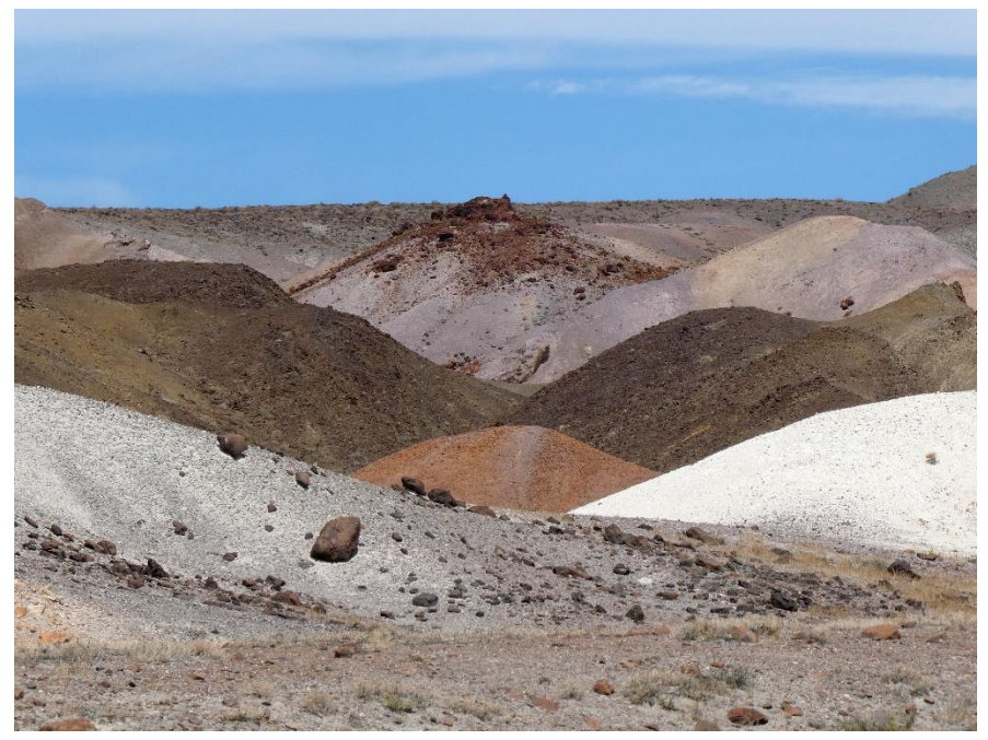
Hiking around Monte Cristo's Castle

another Nevada State Park, but the effort failed. As a result, there is no signage for it along the highway, and it does not appear on most maps, so I've had the place to myself for both visits.