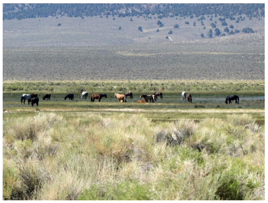
It took wild horses to make me take this picture at River Spring Lakes Ecological Reserve, California.

I was in Hawthorne for two nights, using it as a base for a return visit to the Mono Lake Basin area, just across the border in California on the eastern edge of Yosemite National Park, for a few new and a couple repeat stops.