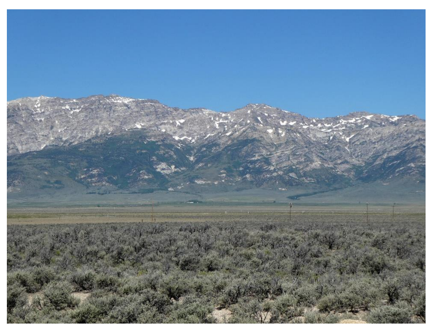
Snow melt from the Ruby Mountains feeds both Ruby Lake as well as the Humboldt River. No rubies were found here, but garnets found here look kind of like rubies.