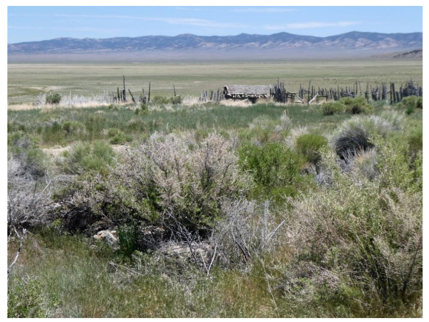
A civilian merchant's cabin survives at the Fort Ruby site

Little survives of Fort Ruby, which was built in the 1860s to protect miners' interests in the Ruby Mountains as well as a segment of the passing California and Overland Stage Line trails. The Pony Express also passed by here, but it was shut down the year before Fort Ruby was built.