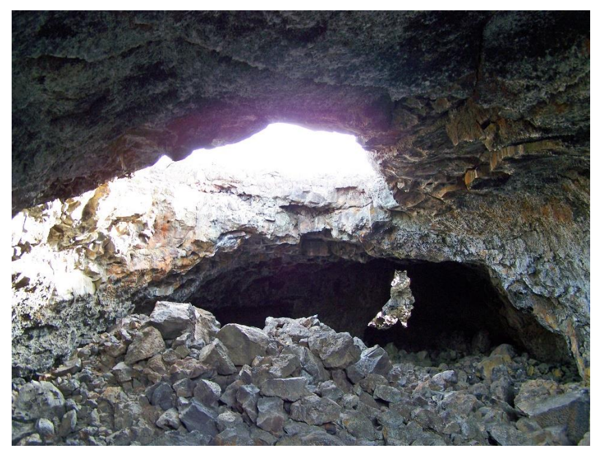
Food for thought should you decide to explore one of the lava tubes, like here in Indian Tunnel.

As I was preparing my final trip itinerary, my Windows 10 PC greeted me with a beautiful picture of Shoshone Falls in Idaho. Where in Idaho, I wondered, only to find that it is on the Snake River in Twin Falls, Idaho. Oh. I've passed through Twin Fall several times over the years, and never thought to actually look for any falls. But I was staying there for two nights on this trip, using it as my base for visiting Craters of the Moon. On my return to the city, I checked out the falls. Alas, not as pretty as on Window 10, because the volume of water going over the falls was pretty low at the time of my visit.