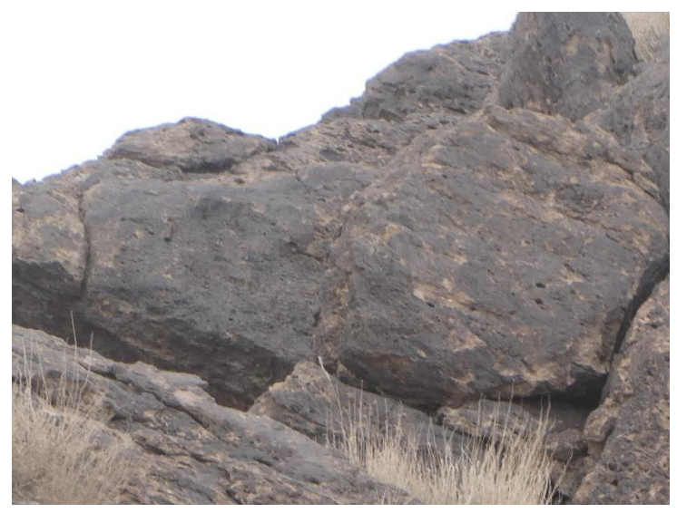
But the petroglyphs here were old enough that many had been re-covered by desert varnish, making ones near the top of the ridge difficult to see from ground level, such as the petroglyph towards the left on this rock near the top that I saw from the ground.

Although the last day was a bit of a letdown, it was still a great trip. And a pretty good way for me to mark turning 60.