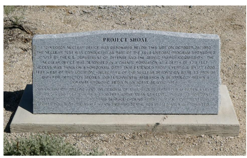
The Project Shoal Memorial

any signage, let alone monuments. I found the specific location after I got home, so I added it to the itinerary for this trip. Project Shoal was an underground nuclear test in 1963 in an area known for its seismic activity. The purpose was to help the Defense Department and Atomic Energy Commission learn how to detect, locate and measure underground detonations. The 12-kiloton bomb was detonated in granite rock 1,211 feet below ground surface.