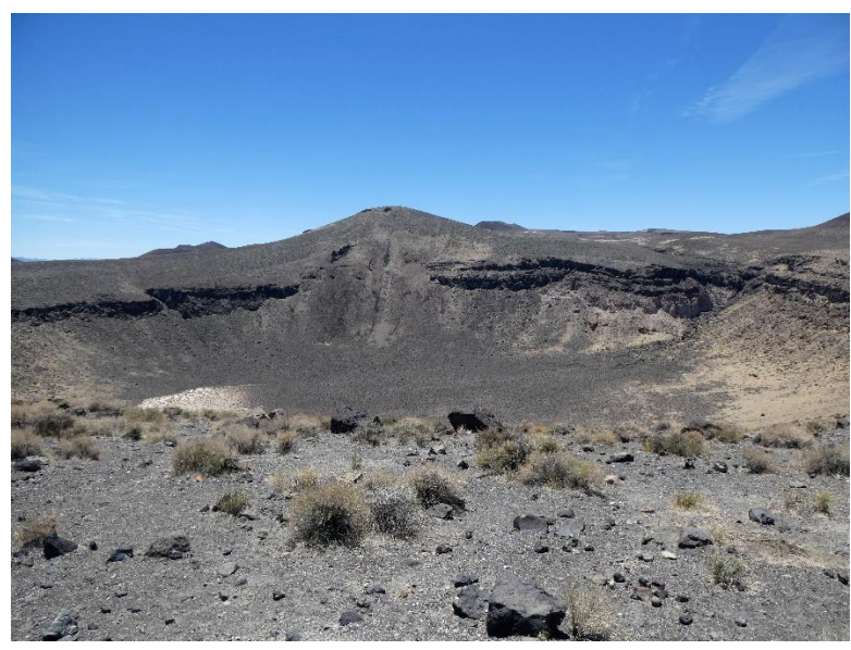
400-acre Lunar Crater has been used for astronaut training and for testing Mars landers.