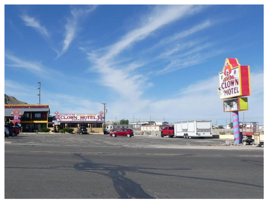
Tonopah's "world famous" Clown Motel. What could be more relaxing than a stay at a clown-themed motel?