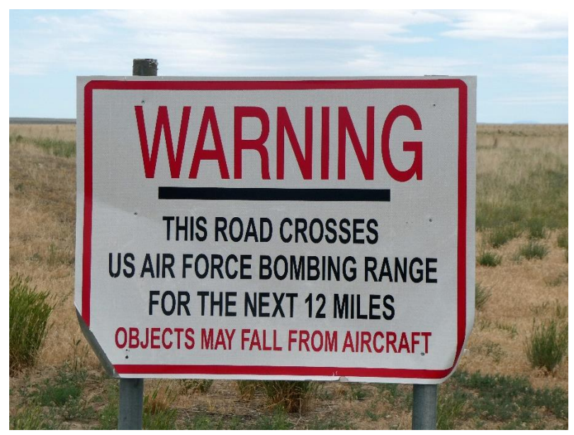
If I had been hit by one of those falling objects when crossing the Saylor Creek Bombing Range, it would have been an utter disaster.

There's a volcanic hotspot that the North American tectonic plate has been moving over for millions of years. It was located under the southwest corner of Idaho about 15 million years ago, and as the plate moved the hotspot moved northeast across southern Idaho. Today, it is located beneath Yellowstone National Park. During this time, it produced numerous calderas and associated volcanic activity. As a result, much of this area sits atop a thick layer of basalt rock. Most of what I'd see during the rest of my trip through Idaho was tied to this past volcanic activity.