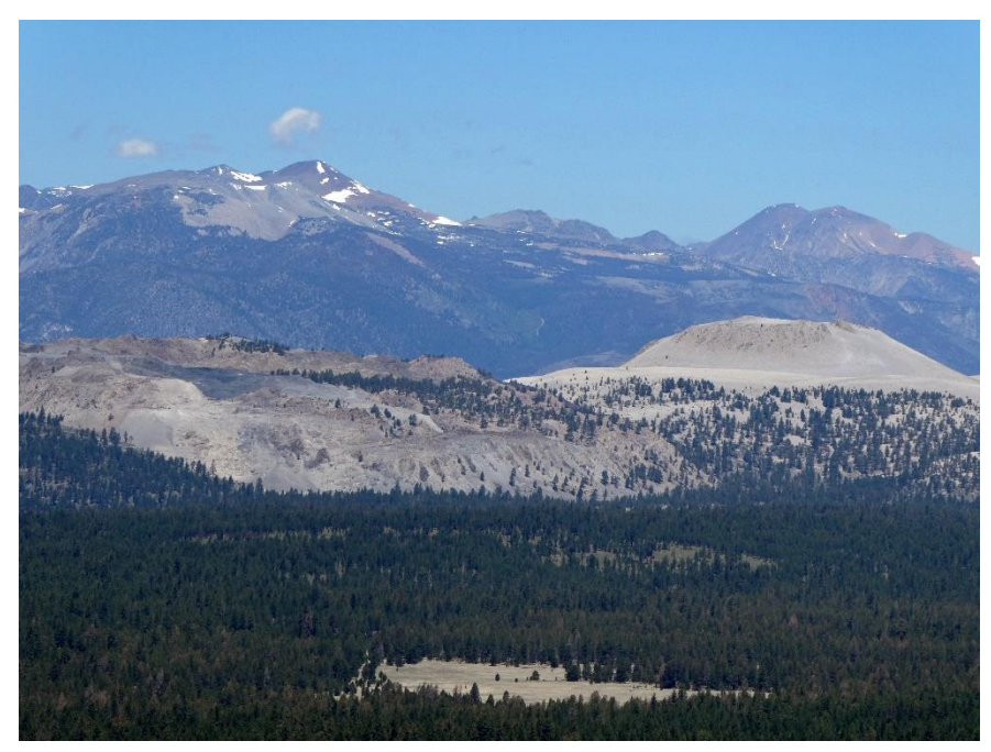
The last mile of the drive to the summit of Bald Mountain, California, was "interesting", to say the least, but it was worth it for its outstanding views of distant Mono Lake, the Sierra Nevada Mountain Range at Yosemite, pictured, and some Mono Basin volcanic features, including Crater Mountain, center right.