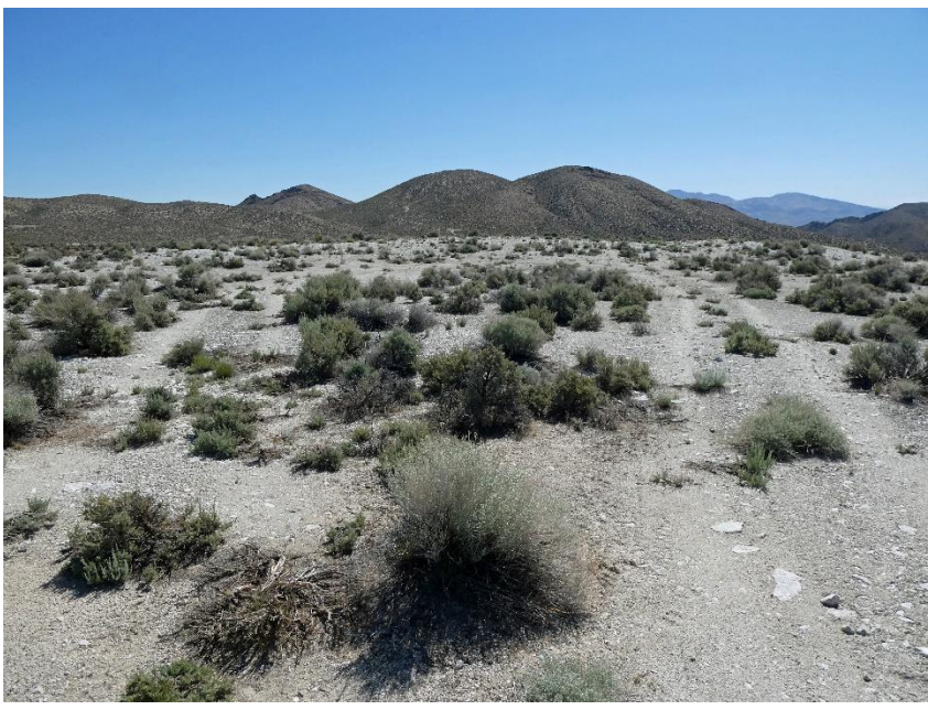
Standing atop the debris pile at the Project Shoal site where the shaft was drilled for putting the bomb in place

Excavation, drilling and collecting rocks and soil is strictly forbidden for 3,300 feet in all directions surrounding this spot, so I didn't bring any of you souvenirs from this stop.