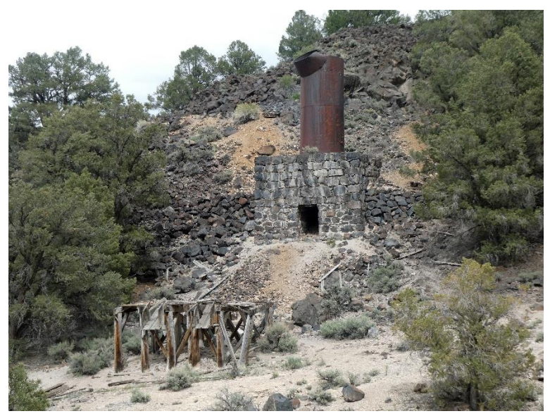
The Magnum Mill ruins near Aurora

Due to the lack of enough water for both mine operations and the people to drink, the stamp mill at Candelaria operated as a "dry mill", which allowed its toxic dust to spread throughout the community, ultimately killing many of the people who worked the mines.