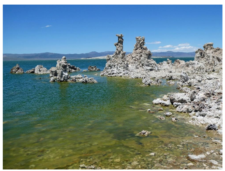
I repeat-hiked the trail at the South Tufa Area at Mono Lake. When the lake was deeper, calcium carbonate minerals in springs that fed the lake produced tufa spires and formations that were exposed when lake water levels dropped.