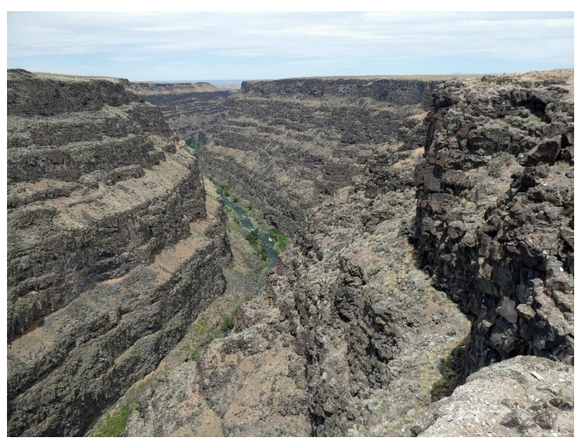
I risked getting hit by falling objects crossing a bombing range to see the Bruneau River, which has carved this 800-feet-deep canyon into thick layers of volcanic basalt and rhyolite rock. The top of the canyon is about 1300 feet wide.