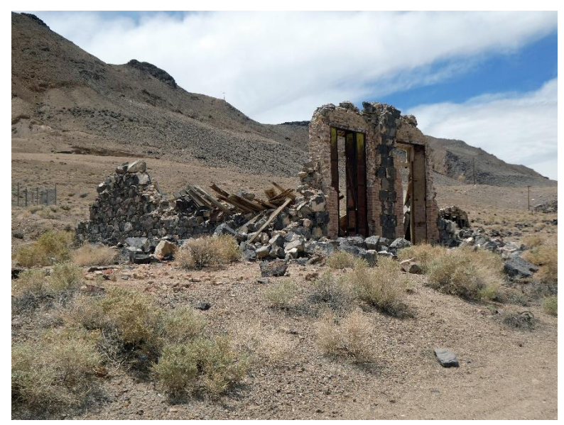
Main Street ruins in Candelaria, an old mining camp ghost town

I visited several ghost towns on this trip – several more, if you also include the ones that I drove through without realizing it. Nevada has more ghost towns than any other state in the country, and in fact it has more ghost towns than living towns. I stopped at five just between Tonopah and Hawthorne, and a couple more that afternoon after reaching Hawthorne.