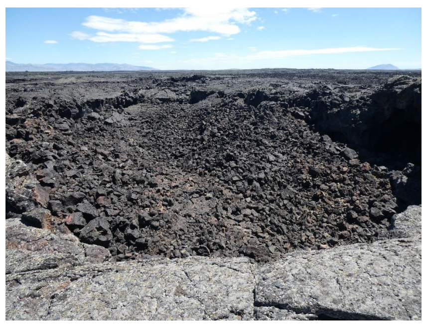
According to the sign along Caves Trail, this lava tube "collapsed like peanut brittle".

A lava tube is created when the surface of a channel of flowing lava begins to harden while what's underneath is still flowing. If what is flowing underneath completely flows out, the result is a tunnel called a lava tube. There are miles of these at Craters of the Moon, although they all eventually will collapse.