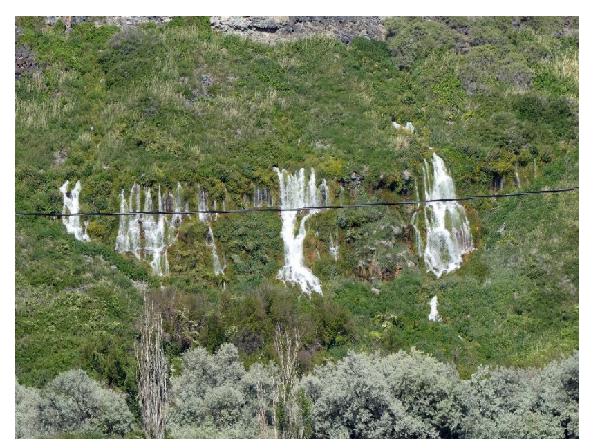
Volcanic rock can be porous, so a lot of water soaks into it in the region. At Thousand Springs, visible across the Snake River from Highway 30, you can see a wall of flows like these, where water pours out of the volcanic rock and into the Snake River below.

Some volcanic flows helped create a large pond system whose sediments preserved fossils from the Pliocene epoch (starting about 3.5 million years ago). This is the period when many modern plants and animals began emerging. This is the world's richest source of such fossil deposits, and it is protected by Hagerman Fossil Beds National Monument. I've stopped here a handful of times over 30 years now, and