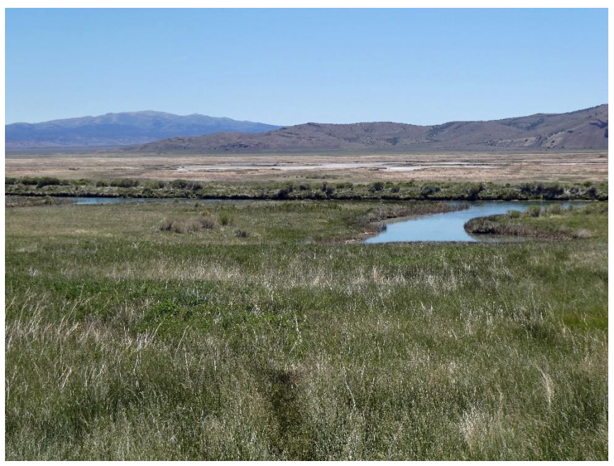
The Ruby Lake area is one of a number of wetlands in the valleys between mountain ranges in central and northern Nevada. This is along a major bird migratory route.

I headed south into Nevada, with the Ruby Lake National Wildlife Refuge area and the backroad leading south out of it being my primary focus en route to Ely, Nevada. I had briefly visited the area before, but missed Fort Ruby.