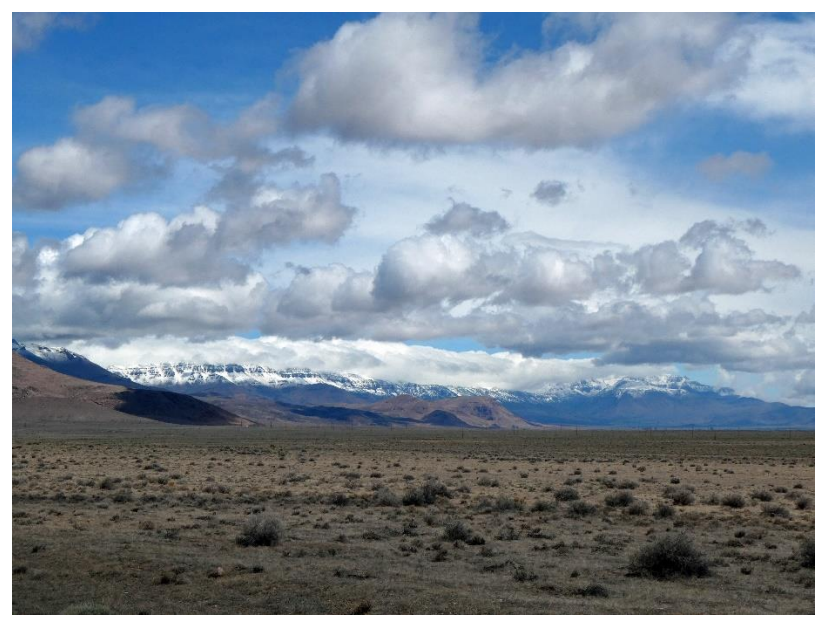
East-facing side of Steens Mountain

I skirted the storm with a more westerly route that took me past Steens Mountain and through Malheur National Wildlife Refuge, repeat visits. Steens Mountain is about 50 miles long and rises to over 9,700 feet. It is one of a number of mountains in this area created when big blocks of the earth's crust separated and then tilted, followed by erosion that helped fill broad valley floors – classic Basin and Range Province fault block mountain formation.