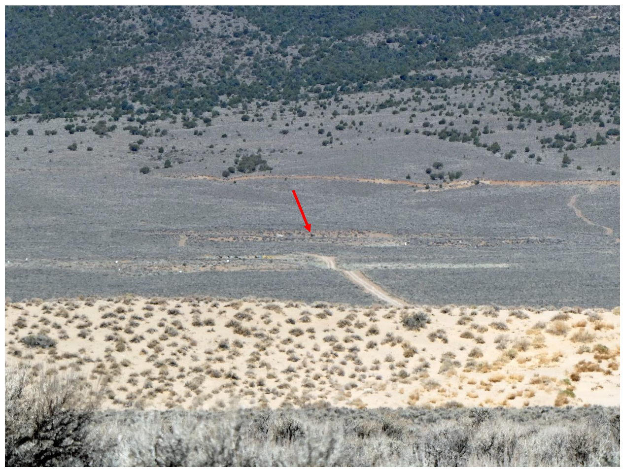
Ground Zero, site of the Project Faultless Nuclear Test Site

I planned on two nights in Ely, where I'd head out on Highway 6 in the morning to the Lunar Crater Volcanic Field, and then double back to Ely to head out on Highway 50 to look for the Hamilton Ghost Town. But while I was in the hotel perusing one of my maps, I spotted a dot well off Highway 6 labeled Project Faultless Nuclear Test Site. I looked up some information on that and decided that I wanted to see it. I pulled up Google Satellite so that I could sketch out a decent map to get to it. That's when I spotted something labeled Petroglyph Butte not far from there, certainly a name intended to catch my eye. I looked that up and found that not only was it was a petroglyph site, but likely also a ritual site. I sketched out more map instructions, and scrapped my plans for Hamilton.