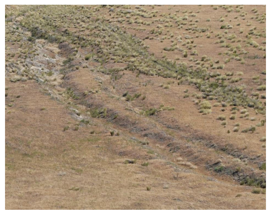
From Hagerman's Oregon Trail Overlook, you can see a small section of the original Oregon Trail.