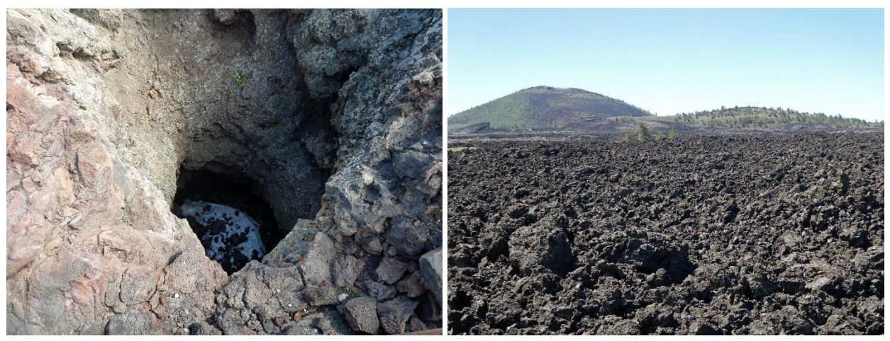
Snow at the bottom of a spatter cone (left); lava field with a pair of cinder cones (right)