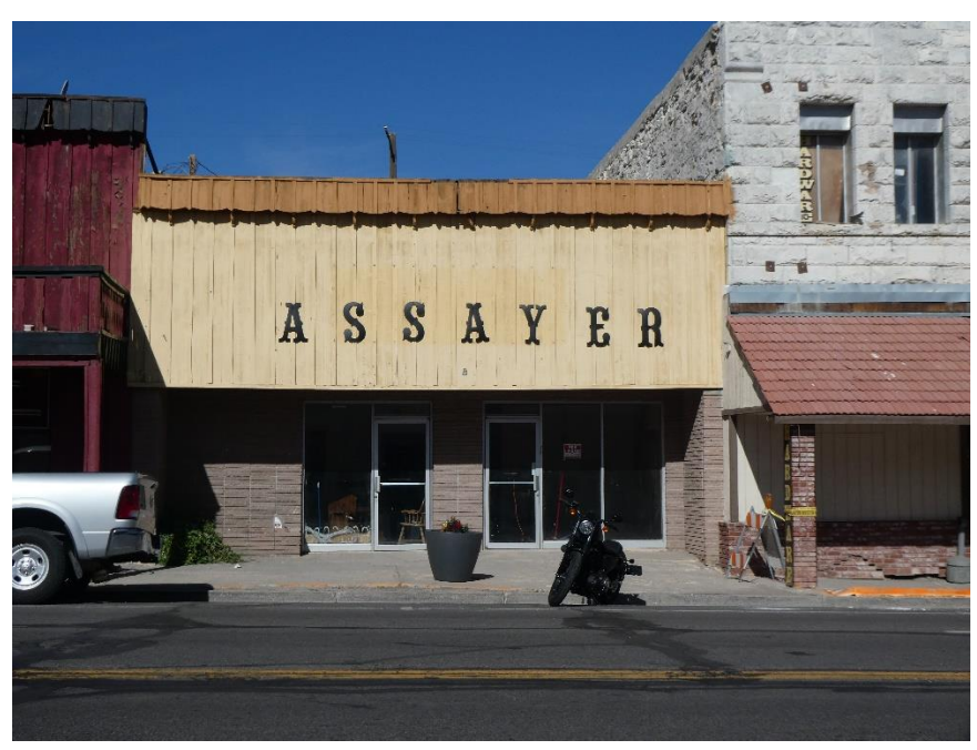
If you think that an "assayer" is something akin to a "horse whisperer", only a bit louder, you'd be wrong. In mining towns like Tonopah, an assayer used a number of tools and tests to determine the type and quality of ore samples from mines. This helped stakeholders determine how much time, effort and money to invest in specific mines and operations.

On my drive to Hawthorne, I stopped at Monte Cristo's Castle. This was a return visit, as I wanted to check out a different area of this colorful landscape. Several years ago, there was a push to make this area