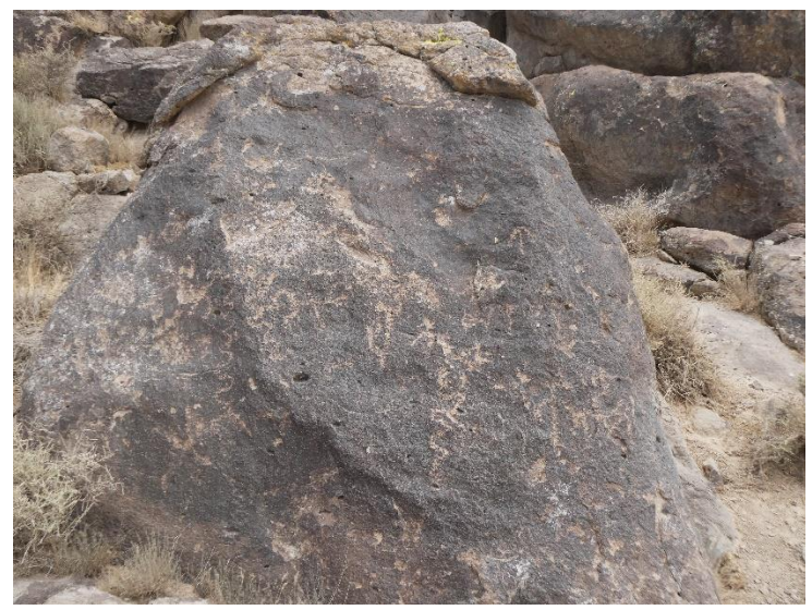
I was not terribly impressed by this rock art panel I found at ground level at Black Point