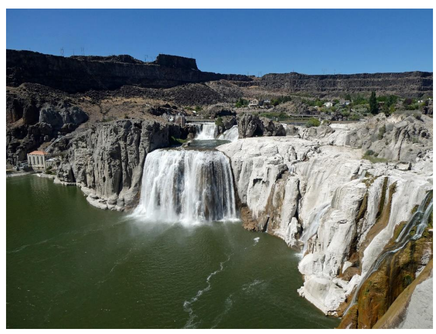
Shoshone Falls, in Shoshone Falls Park, Twin Falls, Idaho

As I was preparing my final trip itinerary, my Windows 10 PC greeted me with a beautiful picture of Shoshone Falls in Idaho. Where in Idaho, I wondered, only to find that it is on the Snake River in Twin Falls, Idaho. Oh. I've passed through Twin Fall several times over the years, and never thought to actually look for any falls. But I was staying there for two nights on this trip, using it as my base for visiting Craters of the Moon. On my return to the city, I checked out the falls. Alas, not as pretty as on Window 10, because the volume of water going over the falls was pretty low at the time of my visit.