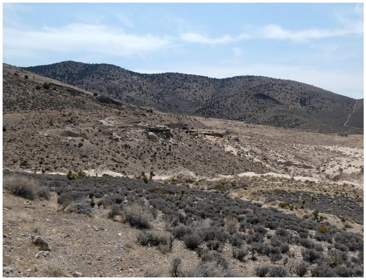
Delamar ghost town

There are mill ruins on the hillside, building foundations in the distance and numerous other ruins scattered around here for what was a town of more than 3,000 people with a lot of stone buildings. But water was limited, and like Candelaria, the mill was a dry operation that put a lot of fine dust in the air – and in the lungs of the people who lived here. Delamar earned the nickname "Widow-maker" because of the number of miners who died from the silicosis that results from breathing the dust.