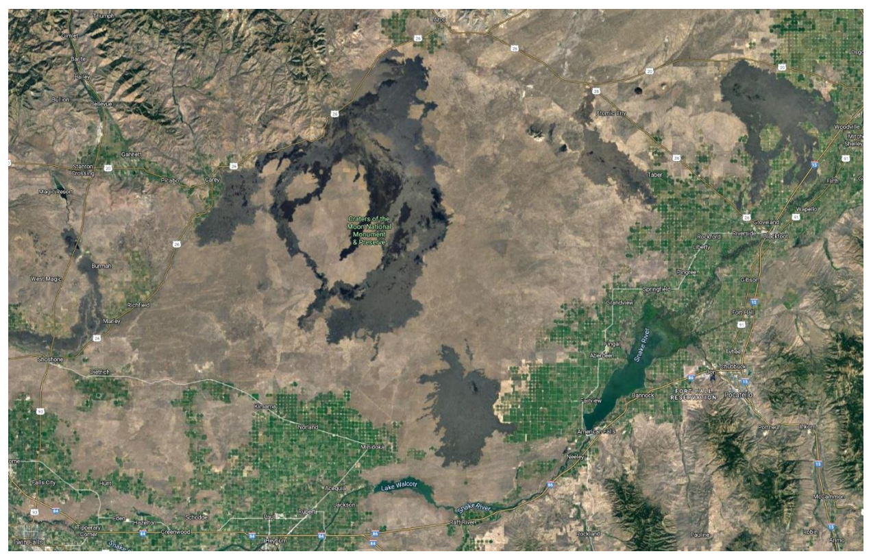
This Google Satellite image shows the large roadless expanse as well as areas where the more recent volcanic activity occurred. (Twin Falls is in the lower left corner.)

There is a large expanse of south-central Idaho that is roadless. Not just due to the volcanic activity as the hotspot passed under the region, but because of the much more recent eruptions of Idaho's Great Rift Zone. Over the past 15,000 years, major eruption periods have occurred here about every 3,000 years. Get there early – the next eruption period is expected in less than 1,000 years!