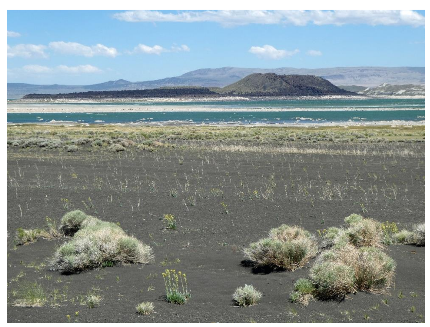
I was standing at the base of 13,000-year-old Black Point Volcano as I took this picture of Negit Island in Mono Lake and its 2,000-year-old volcanic cone.

I left Hawthorne the next morning, heading north on one of Nevada's many unpaved backroads towards my first destination of the day, the Project Shoal Atomic Testing Site. I found a reference to Project Shoal a few years ago on one of my maps, and impulsively tried to check it out then, but I didn't come across