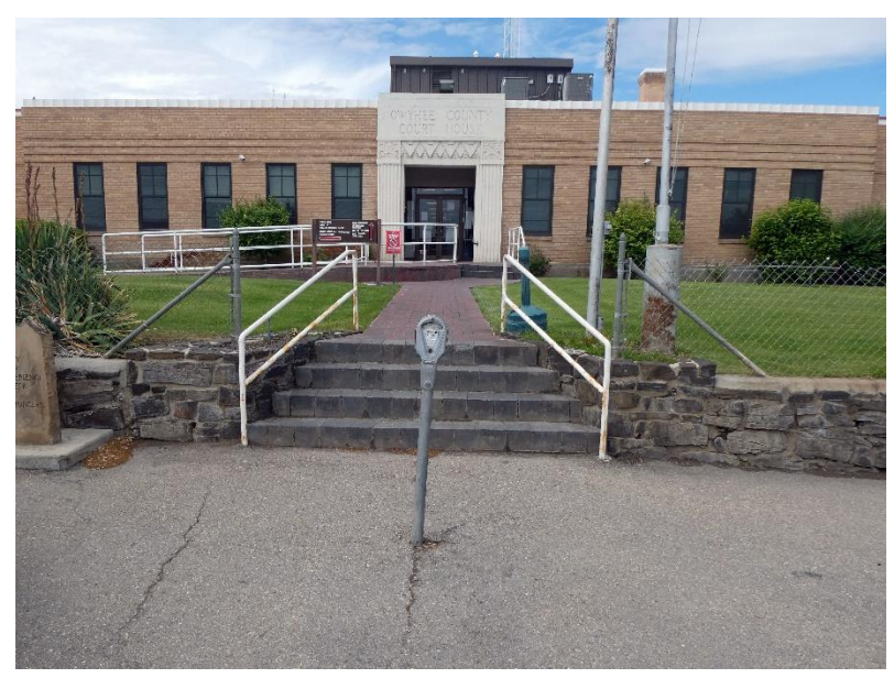
In the 1950s, a lone parking meter was installed in front of the Owyhee County Courthouse in Murphy, Idaho, as a gag to discourage people from parking in front of a gate-entrance that was there at the time. The meter has stuck around even though the gate is long-gone. And it actually works. And not just in terms of collecting money. It was a weekday when I stopped by, and most of the parking spots were taken, leaving just the space where I parked and the spot in front of the meter.