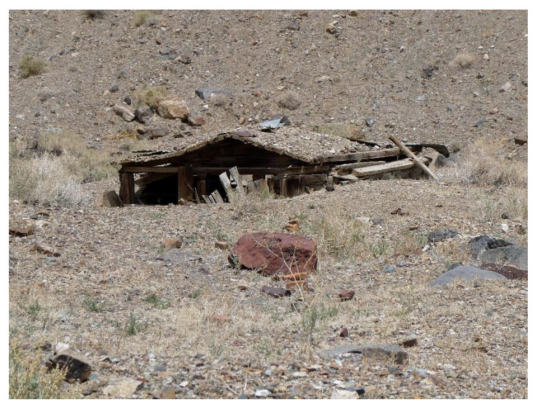
Remains of an old Candelaria house. I think that people were a lot shorter in the olden days.

Due to the lack of enough water for both mine operations and the people to drink, the stamp mill at Candelaria operated as a "dry mill", which allowed its toxic dust to spread throughout the community, ultimately killing many of the people who worked the mines.