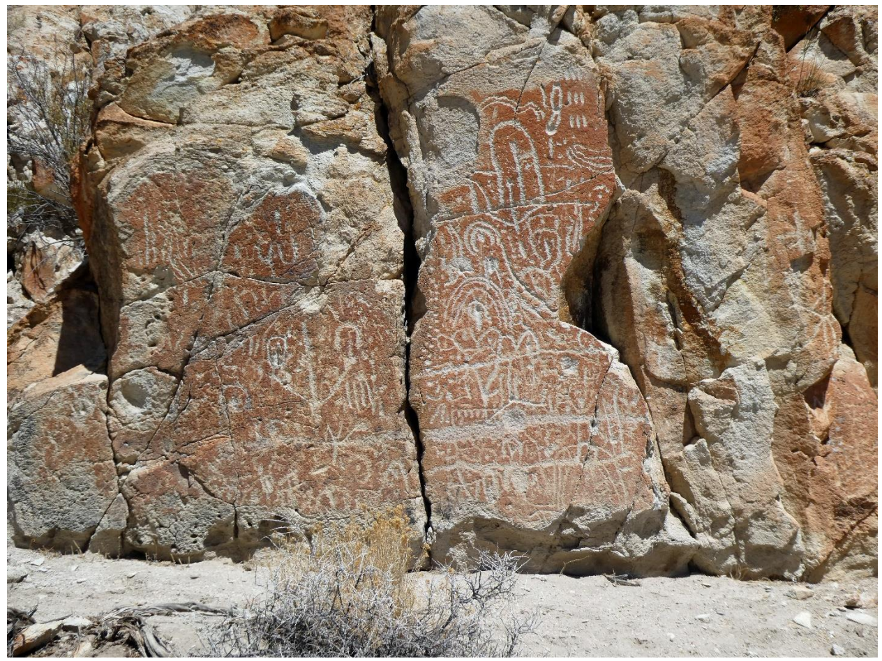
The biggest rock art panel at Moore's Petroglyph Site

I made a return visit to the Lunar Crater Volcanic Field, which last erupted about 38,000 years ago.