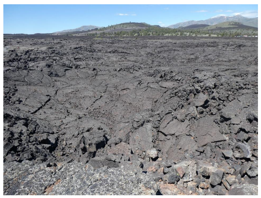
And this lava tube "collapsed like a soufflé".