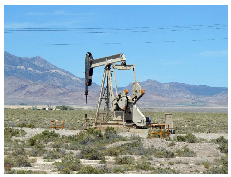
Nevada has a relatively small oil industry. It perhaps could be more productive with the help of a little nuclear fracking.

I had three planned stops for the drive home on my last day of the trip. But the last couple miles of the road to remote Delamar Ghost Town were narrow and strewn with tire-shredding rocks, so I didn't get as close as I wanted. My stop at Black Point Petroglyph Site was limited as most of the panels were on top of the butte, and I was only about halfway up when my still-problematic foot made it clear that I should turn around. And for reasons unknown, the petroglyph trail at Pahranagat National Wildlife Refuge was closed. So, I didn't have quite the last day that I had planned on.