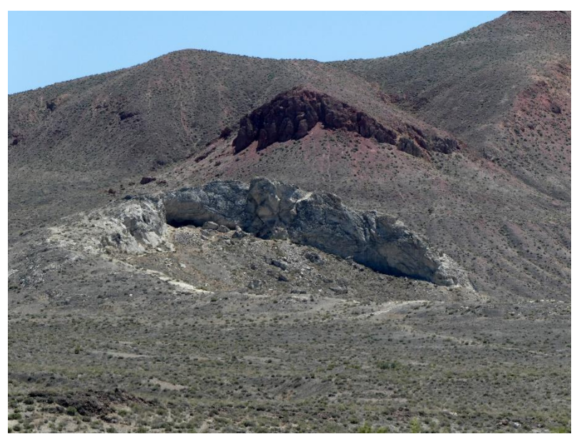
Lovelock Cave comes into view

Lovelock Cave, like Grimes Point, is located on the edge of the former Ice Age Lake Lahontan. It is also close to the Humboldt Sink. It was occupied as much as 4,500 years ago and used for over 4,000 years. More than 10,000 items have been excavated from the site, including 11 duck decoys made of bundled grasses, most painted and covered with feathers and dating back more than 2,000 years.