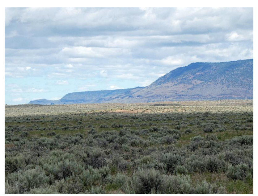
The west-facing Catlow Rim of Steens Mountain rises above Catlow Valley.

Most of what I had planned to see in Idaho were repeat visits, but it had been years – even decades in some cases – since I had seen many of these places.