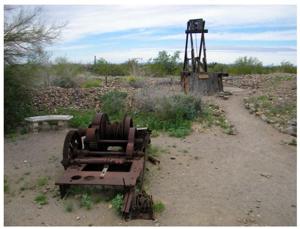
The 1871 Flora Temple Mine, the second patented mine in Arizona.