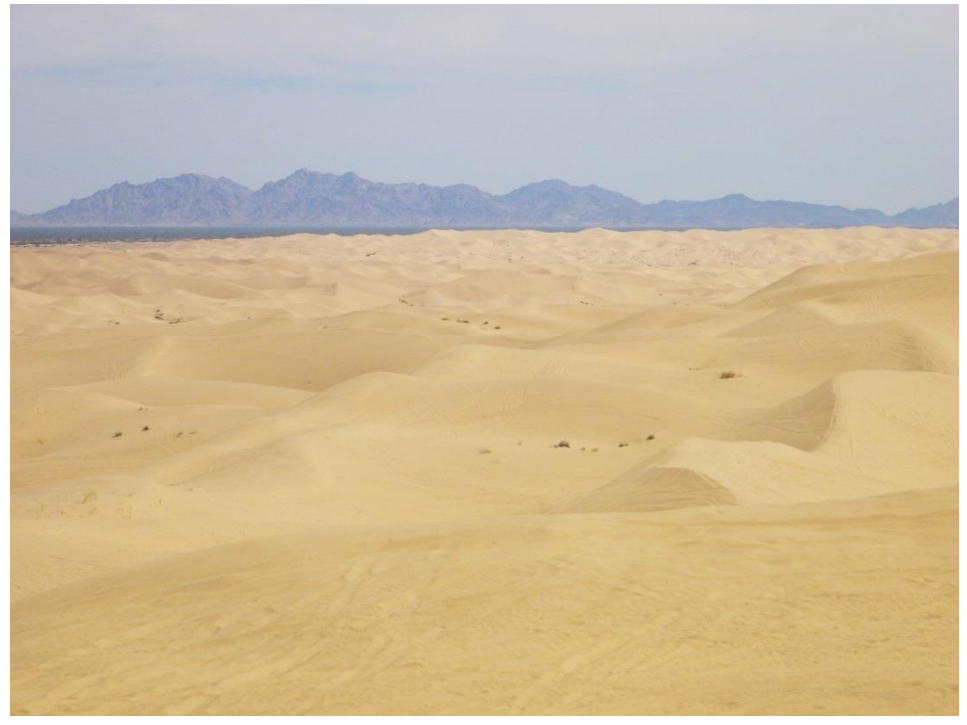
I passed through the Imperial Sand Dunes on my drive to Yuma.

As long as I was at Anza-Borrego, I decided to hike the stretch of Fish Creek Wash through Split Mountain, a planned stop in the park that I ended up skipping last fall.