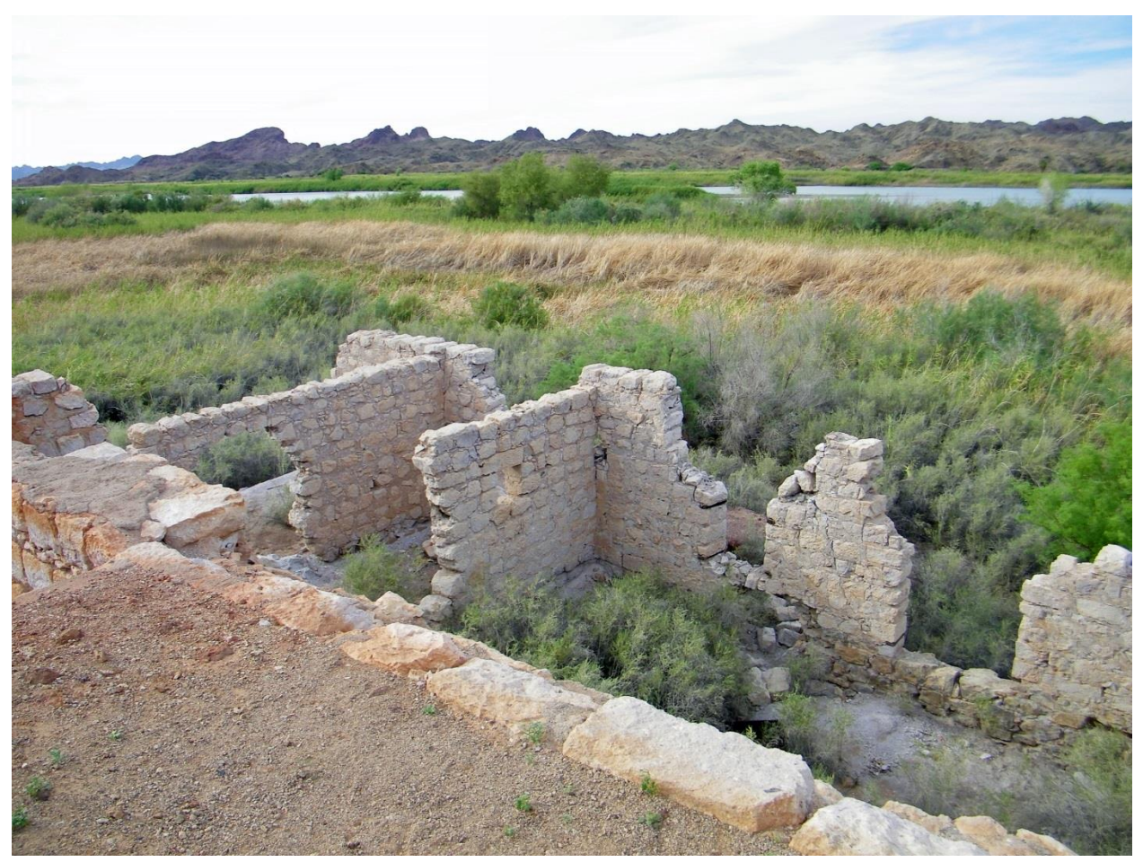
Lower Mill ruins, the Colorado River and view towards Imperial National Wildlife Refuge.

As remote as it is, little more than a century ago the town of Picacho had about 3000 people, one of a handful of mining towns served by riverboats that headed up and down the Colorado River.