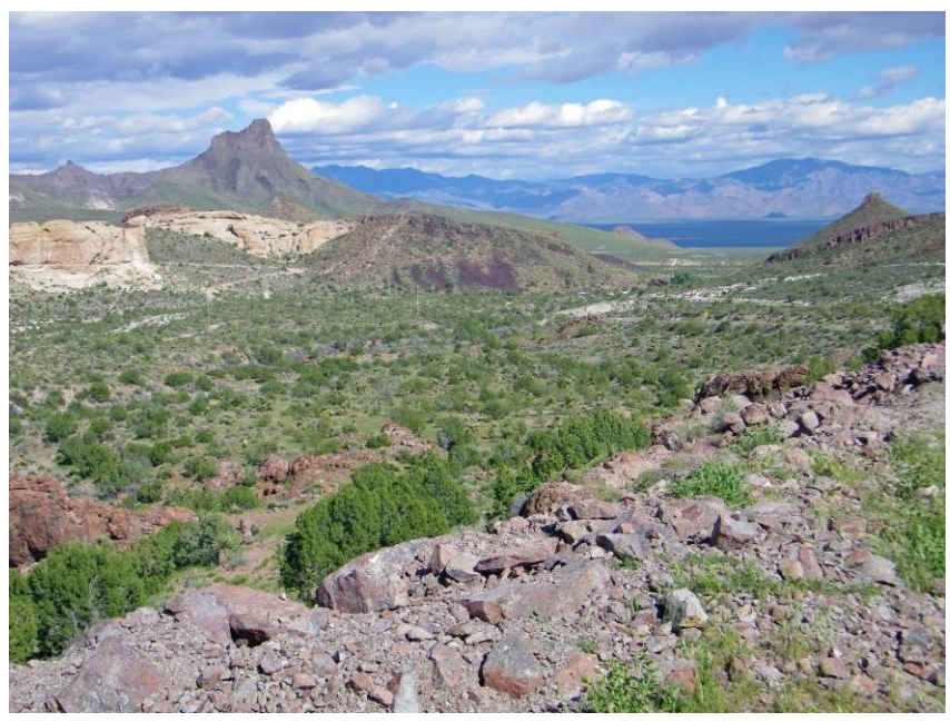
Along original Route 66 in the Black Mountains.

Leave Interstate 40 west of Kingman, Arizona to drive the Route 66 National Back Country Byway, an original segment of Route 66 that passes through the Black Mountains and Mount Nutt Wilderness.