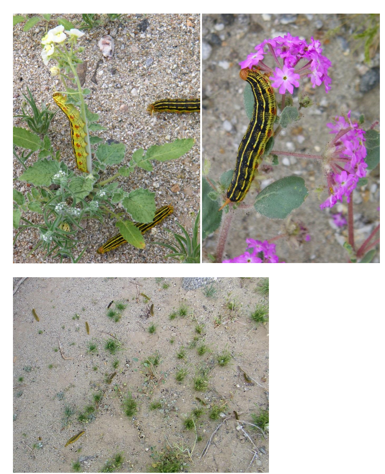
Uh-oh. I think the caterpillars are turning on me.

So how long does a superbloom last? Depends on the weather. And it depends on the local caterpillar population, which thrives when the wildflowers do.