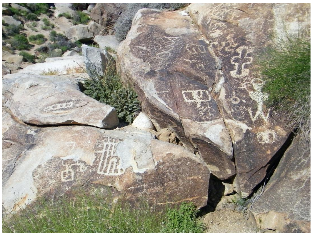
Petroglyphs at Grapevine Canyon, the oldest of which are believed to be almost 1000 years old.