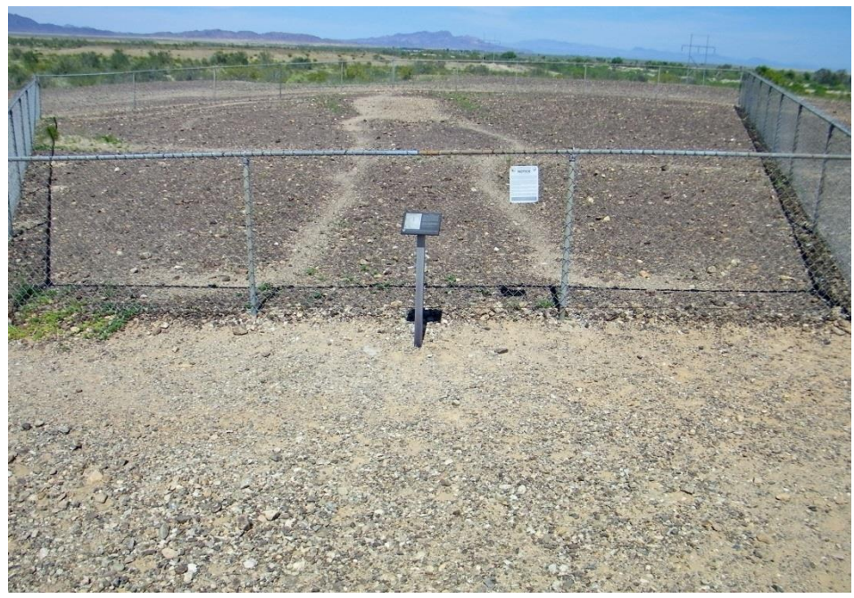
A human figure at the Blythe Intaglios site, 102 feet from head to toe.