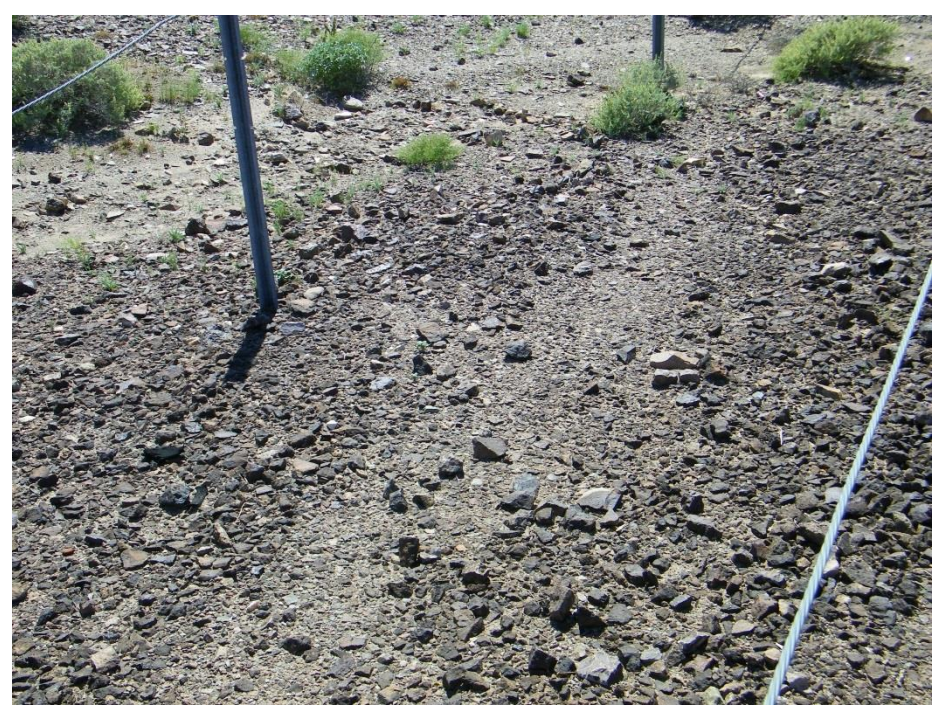
Not a geoglyph, but rather the trace of a pre-Columbian Native American trail that connected the Colorado River to today's Imperial Valley.

Fringe of the Chocolate Mountains. (Mmmmm, chocolate!) Most of the Chocolate Mountains are closed to the public as the military uses them as a bombing range.