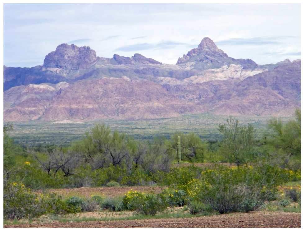
View of the Kofa Mountains to the north of King Road.