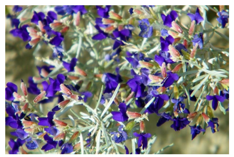
Smoke Trees were also in bloom.