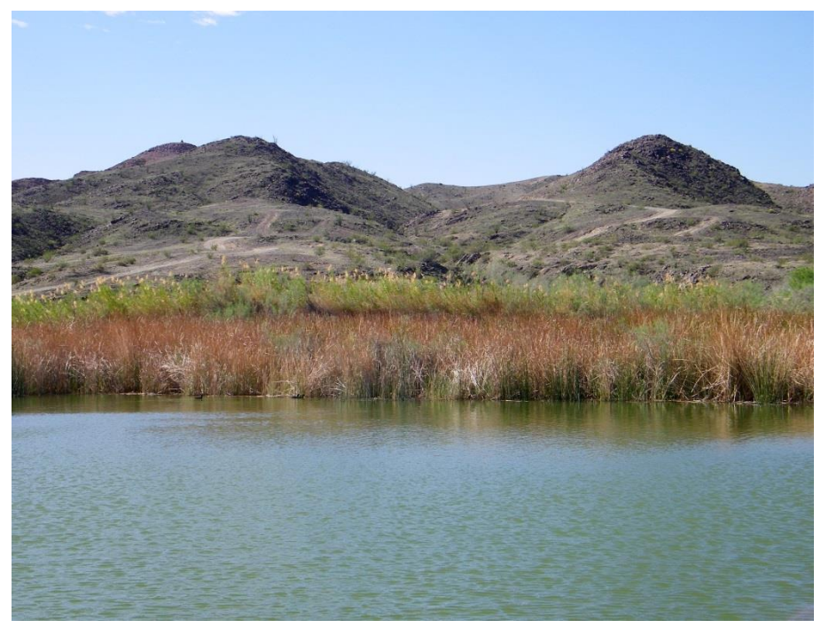
Mittry Lake Wildlife Area

I started my Yuma-area day with a hike along the short trail at Betty's Kitchen, named for a café in a settlement that was once here.