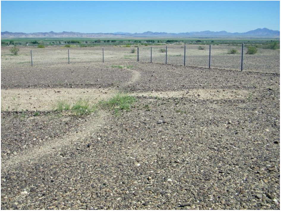
The head and arms of a second human figure. This one is 105 feet from head to toe, and its arm span is 92 feet.