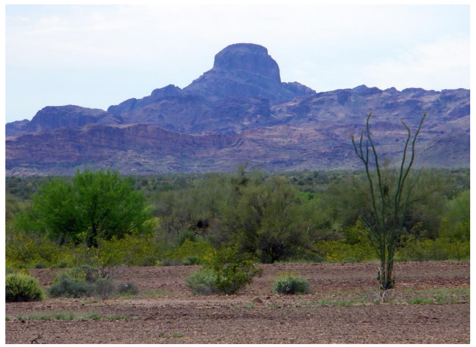
View of Castle Dome in the Castle Dome Mountains south of King Road.

I then drove several miles along King Road into the heart of Kofa, primarily to check out the scenery.