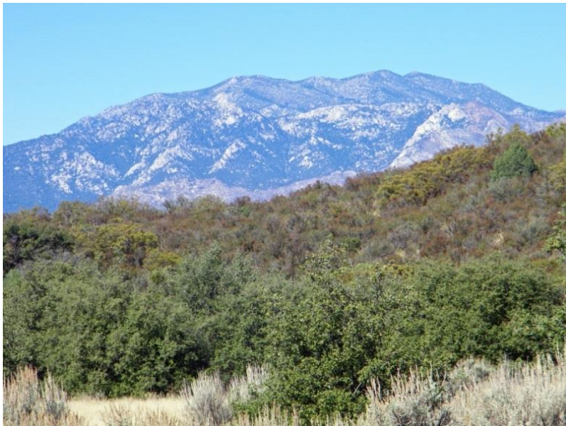
The Pacific Crest National Scenic Trail follows mountains from the Mexican border to the Canadian border, including the Sierra Nevada and Cascade Ranges. It crosses the byway as it heads towards San Jacinto Mountain. I spent some time here hiking a relatively non-rugged stretch of the trail.