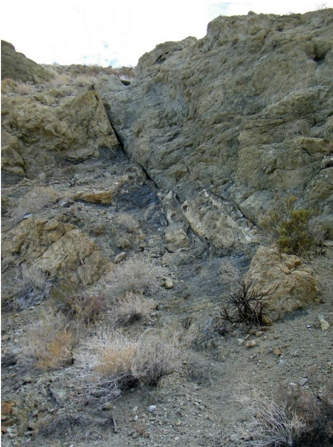
A stop along the Narrows Earth Trail. Anza-Borrego is criss-crossed by faults. A crack like this one, with rounded edges along the crack and different kinds of rock on either side, provides surface evidence of an active fault below.