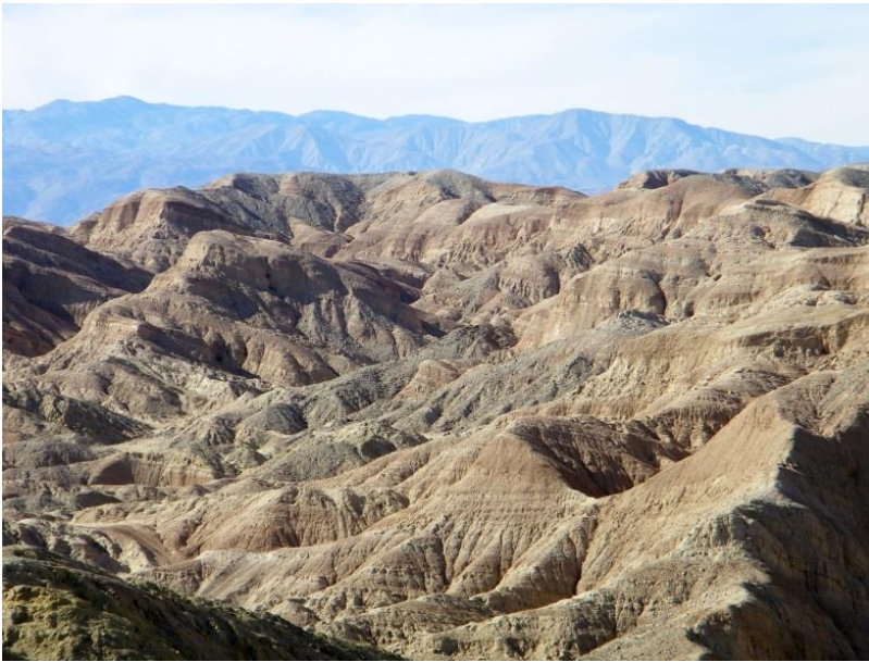
More badlands scenery at Ocotillo Wells SVRA.