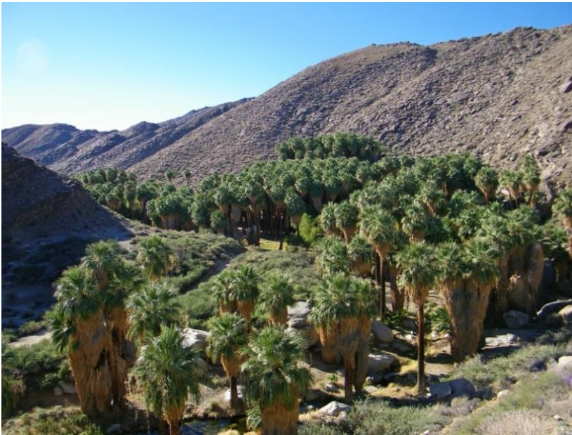
I went hiking at Palm Canyon on the Agua Caliente Indian Reservation, also part of Santa Rosa and San Jacinto Mountains National Monument.