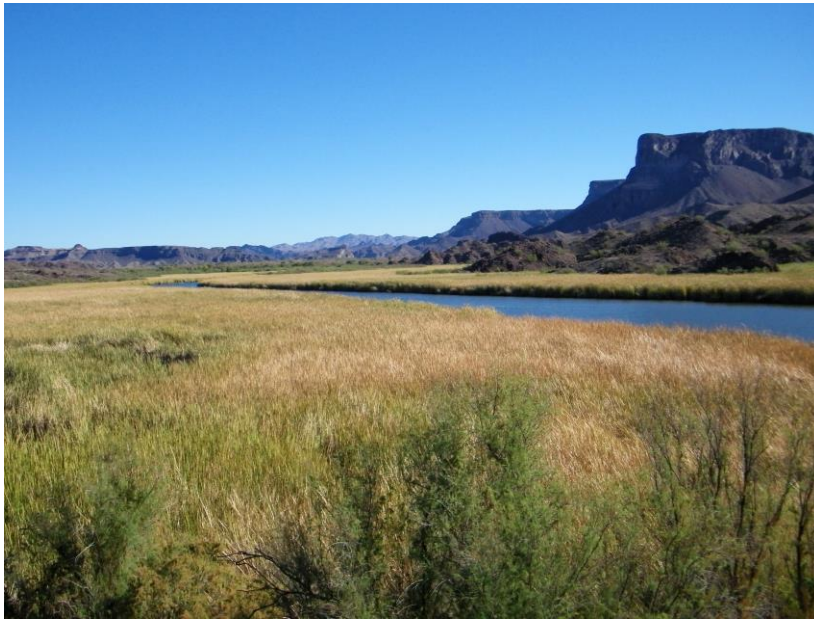
A photo stop on the drive home at Bill Williams River National Wildlife Refuge. This is back on the main highway, several miles downstream from Swansea.