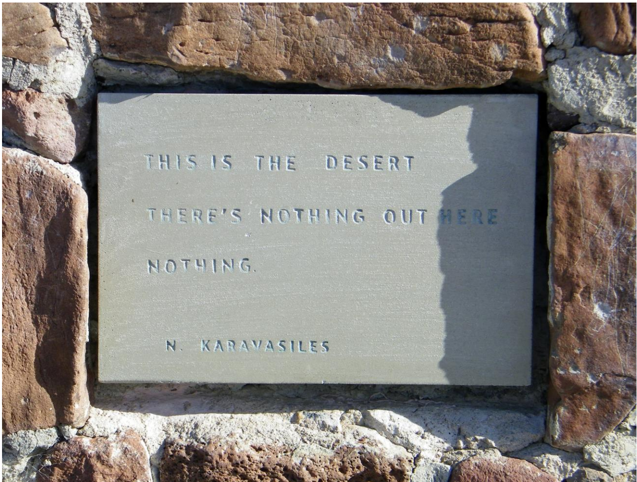
Highway marker at the south entrance to Anza-Borrego Desert State Park.