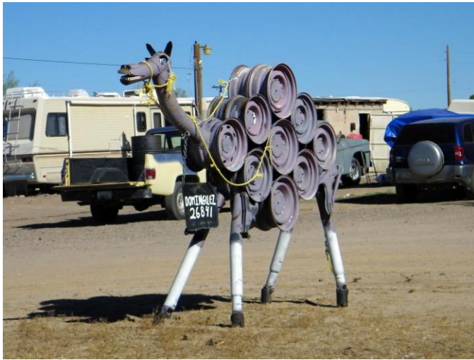
Getting creative with tire rims in Bourse, Arizona.