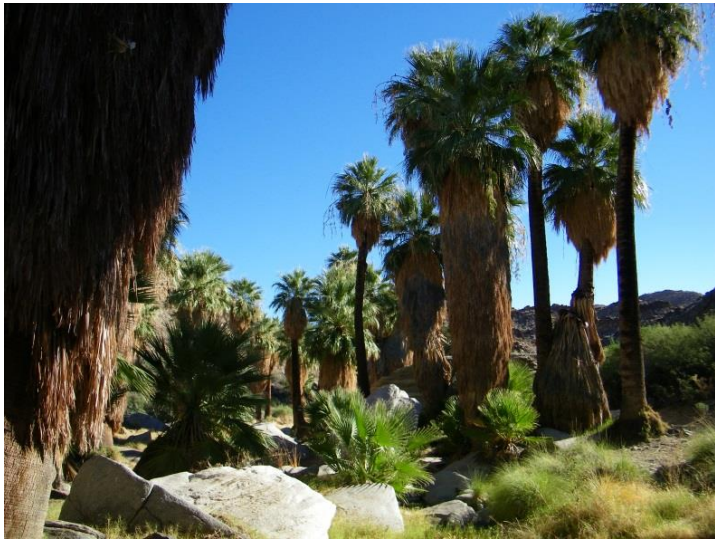
Hiking at Palm Canyon