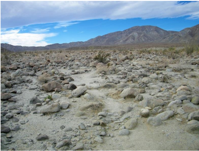
Desert scenery along the Elephant Tree Trail