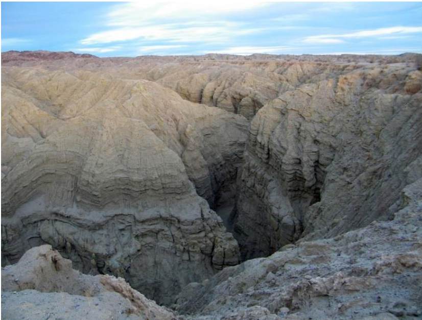
View into The Slot from above.