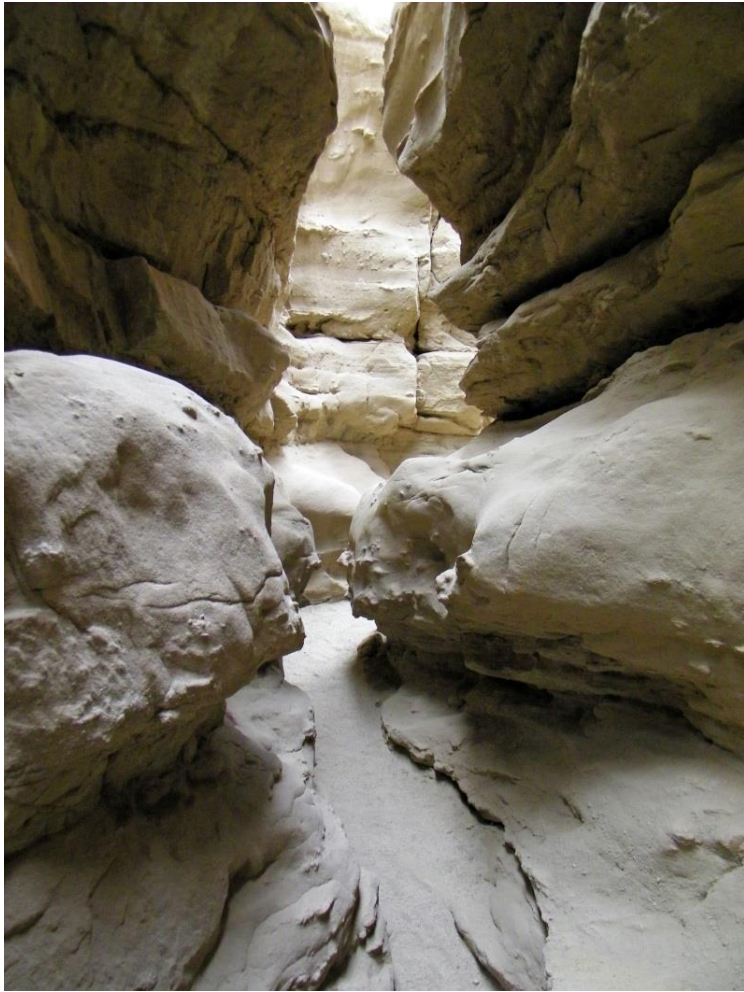
Hiking in The Slot