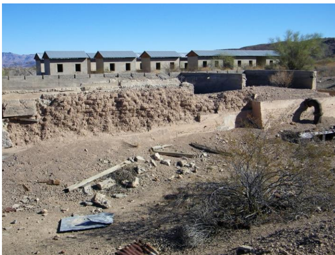
Ruins at Swansea ghost town.