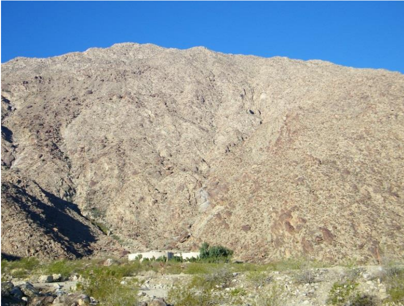
View of San Jacinto Mountain at the Tahquitz Canyon Visitor Center. This area is part of the Santa Rosa and San Jacinto Mountains National Monument.