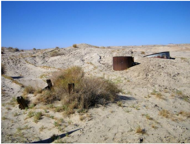
Yuha Well site. The Anza expedition was led here for its reliable access to water.