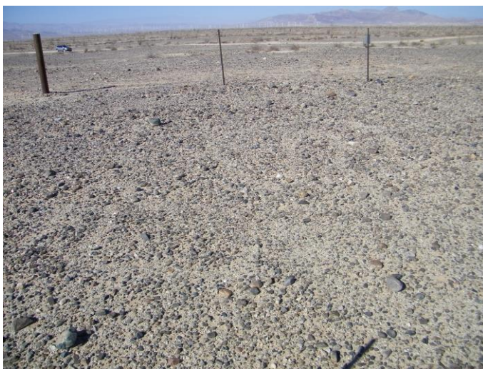
The area also has some geoglyphs, now-faint patterns in the ground's rock cover created in prehistoric times by Native Americans. Unfortunately, several geoglyphs have been damaged or destroyed – sometimes deliberately – by folks driving around the desert.