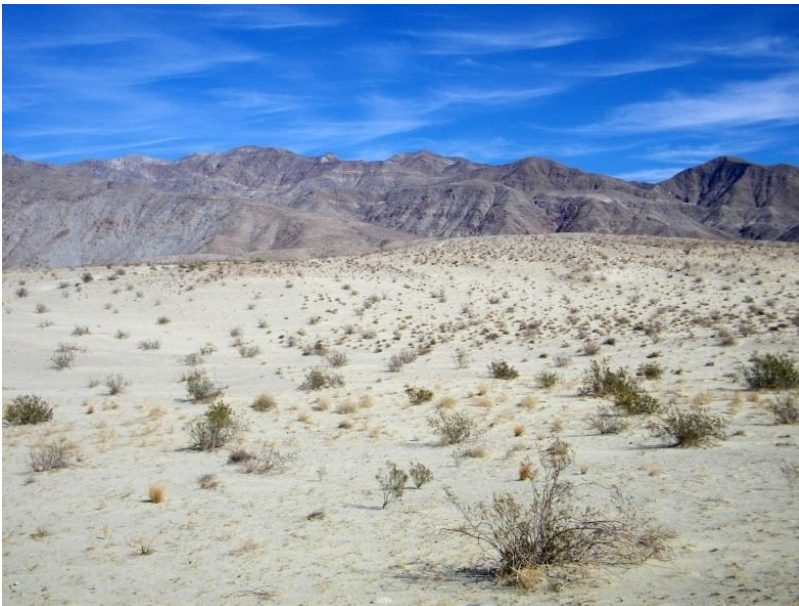
Scenery along Highway S22, the paved road that leads into the park from the northeast.

Font's Point is a rise in the land that overlooks the extensive Borrego Badlands. Eons ago it was an area where the Colorado River delta met the waters of the Gulf of Mexico, and it has the sediments and fossils to prove it. It is reportedly the best place in North America to see deposits from the Pliocene and Pleistocene Epochs.