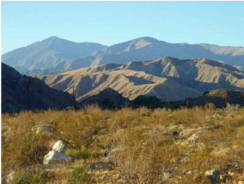
View of San Bernardino Mountains in the national monuments Mission Creek Preserve area.

And that pretty much wrapped up my sightseeing in the Palm Springs area. Next up – Anza-Borrego Desert State Park.