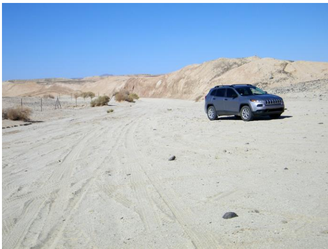
To get to Yuha Well, the road follows a wide gully down from the plateau in the background and then follows the wash for a few miles.