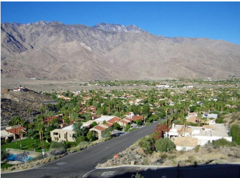
Palm Springs view with San Jacinto Mountain in the background.

The San Andreas Fault and other faults pass through the area. Over millions of years, these have raised the San Bernardino and San Jacinto Mountains to more than 10,000 feet elevation – and some of the sharpest elevation contrasts between mountain peaks and surrounding valleys and flatlands.