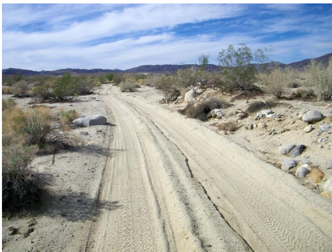
A smooth but sandy segment of the Rockhouse Canyon Road. It was pretty rocky in other areas, and can be impassable when wet.