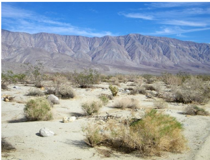
Scenery along the Rockhouse Canyon Road.