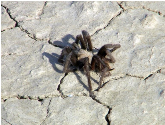
A tarantula. Alas, it never so much as twitched while I was there, so I suspect it was dead.