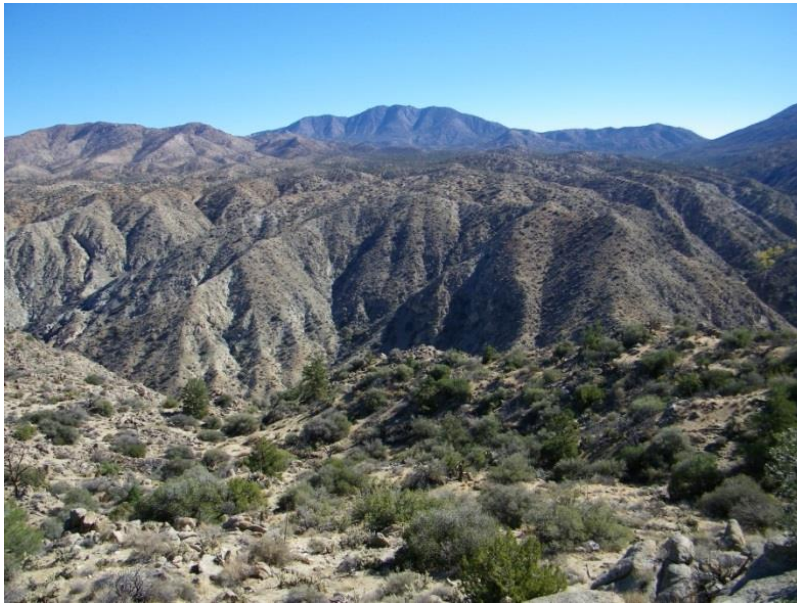
Cahuilla Tewanet Vista Point in the national monument along the scenic byway.