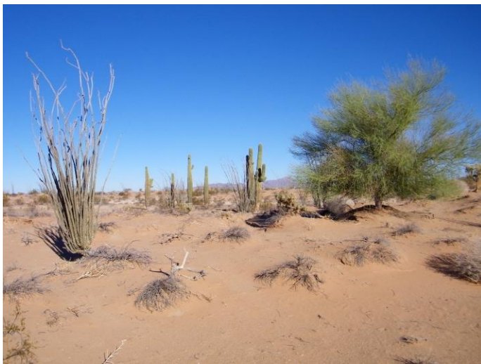
East Cactus Plain Wilderness Area, along the 27-mile gravel and dirt roads leading out to Swansea ghost town, once a mining town.