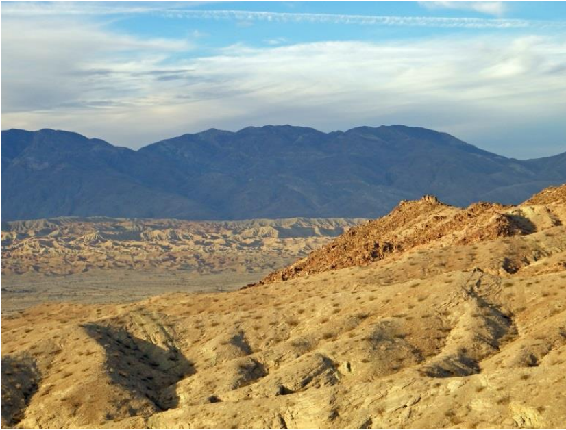
Late day sun on the badlands at The Slot. Font's Point area is in the distance.

My last stop of the day was The Slot, a badlands area that features a small slot canyon. It was late in the day, so I took advantage of the last of the daylight to hike along the ridges of the badlands. It was my first stop the following morning, when I actually hiked down into the slot canyon.