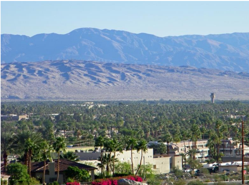
View across Palm Springs.